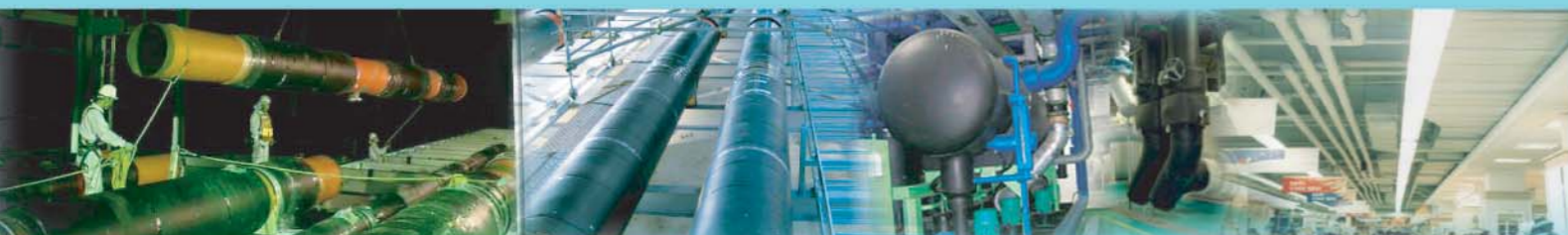
"The pictures depicted above show the applications of thermal insulation products of Superlon Group in insulating the pipes and ducting of heating, ventilation, air-conditioning and refrigerant systems. The pictures are for illustration only and do not imply that the relevant pipes and ducting and the heating, ventilation, air-conditioning and refrigerant systems are assets of Superlon Group."